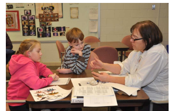
Mini Miners

Society Business items: President Luzier called for all GLMSMC members to sign up and help as volunteers for the upcoming March Annual show. Holly McNeill constructed sign up sheets for members to select volunteer times and activities that work best for them. Student (FRA) members who sign up as volunteers will acquire SSL hours toward fulfilling the MCPS requirement for high school graduation. Many components of the show will need to have volunteer support and some important activities such as the Children's Touch Table and the hospitality section will have to be discontinued if there is insufficient volunteer support. President Luzier repeated his call for a member to step up as the full-time editor of the Rockhouser.